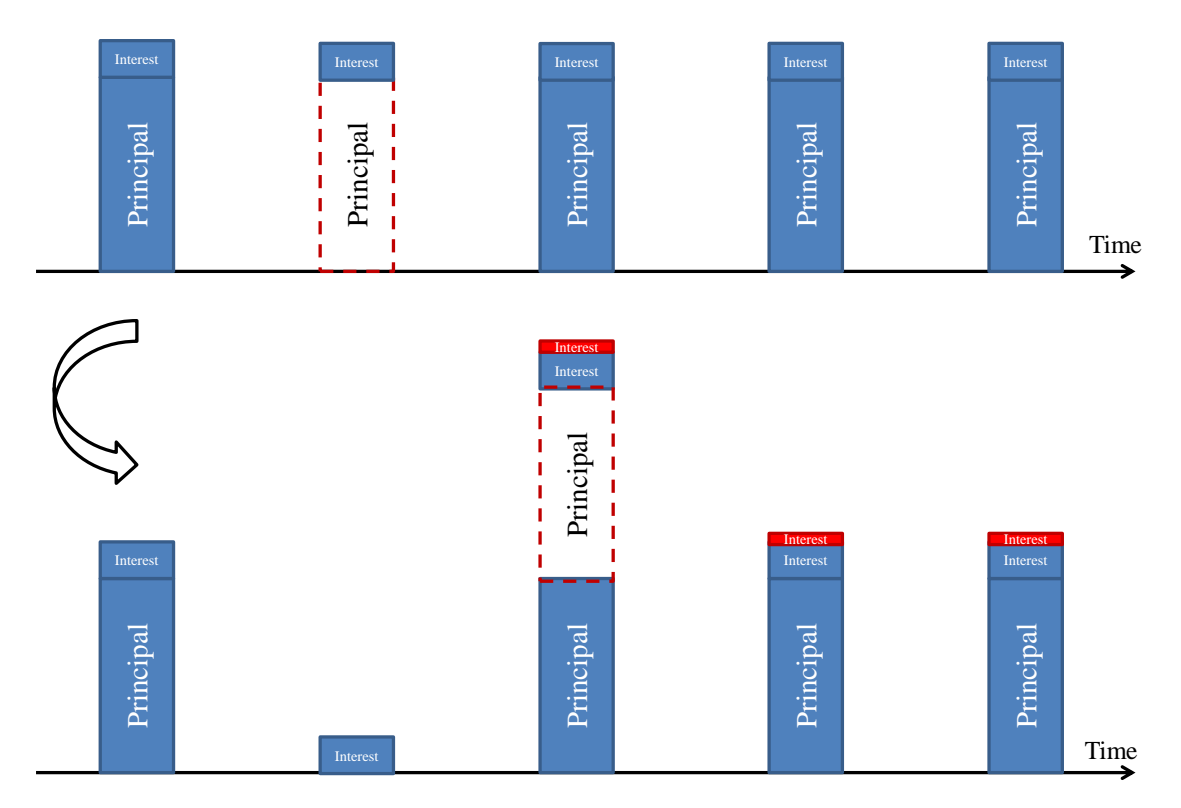
Figure 1: Example of temporary debt restructuring

Note: The horizontal axis in the figures accounts for the time horizon. Each box corresponds the amounts of principal and interest payments at each point. The upper and lower panels illustrate the debt repayment schedule before and after the temporary debt restructuring where only the principal circled by dashed line is postponed without any reduction in principal or interests.